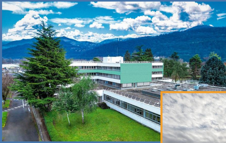
Grenoble, Headquarters & Design center