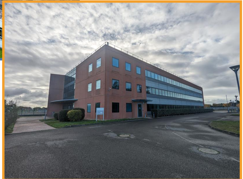
Toulouse, Design center

IC'Alps is a French company that provides customers with a complete offering for Application Specific Integrated Circuits (ASIC) and Systems on Chip (SoC) development from circuit specification, mastering design in-house, up to the management of the entire production supply chain.